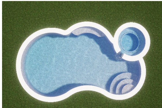
POOL & SPA $69,500